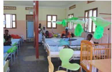
Acute day ward