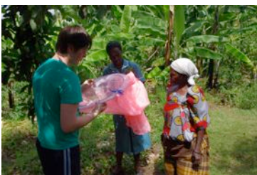
Mosquito net distribution